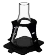
Rubber holder for flask